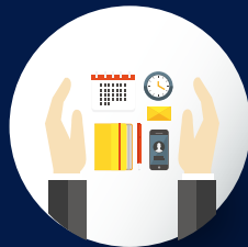
Real-time Tracking Diary