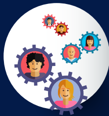
Making the Right Match