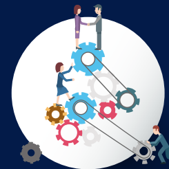
Business Matchmaking Team Assistance